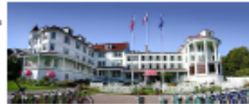
ISLAND HOUSE HOTEL Mackinac Island